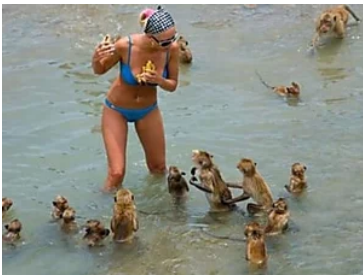
Funny Beach Pictures That Will Make You Laugh Out Loud Sponsored | TooCool2BeTrue