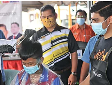
Govt will not stop Covid-19 vaccination | New Straits Times New Straits Times