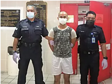
Man gets 5 years jail, whipping for robbing neighbour | New Straits Times New Straits Times