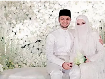
#Showbiz: Neelofa and PU Riz tie the knot [NSTTV] | New Straits Times New Straits Times