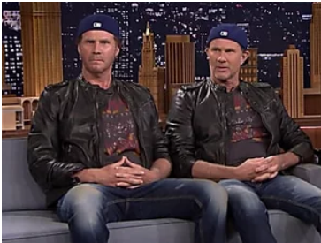
15 Pairs Of Celebs With Crazy Resemblance Sponsored | TooCool2BeTrue