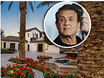
Actor Sylvester Stallone Selling La Quinta, California, Villa at a Loss Sponsored | Mansion Global